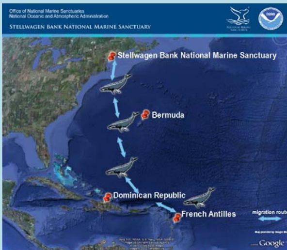
Map showing humpback whale migration route between Stellwagen Bank National Marine Sanctuary and Sister Sanctuaries in the Caribbean.

Salt is a grandmother. Since 1985 she has escorted twelve of her calves from the mating and calving grounds in the Caribbean back to New England’s feeding grounds. She currently has ten grandchildren, representing the third generation of humpbacks in her family group.